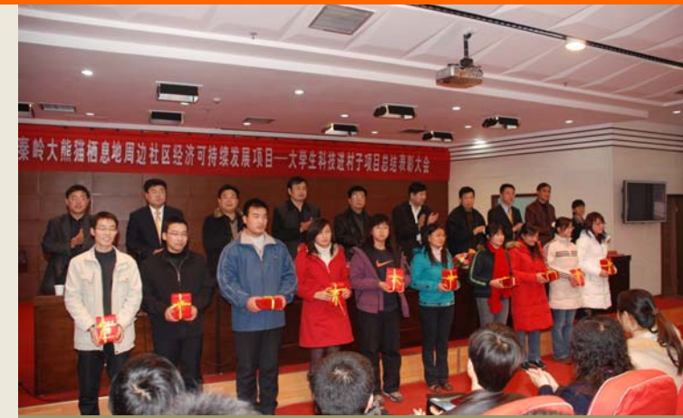
↑ Awarding ceremony

The project, supported by WWF, will be very important in mitigating the conflict between conservation and development and finding realistic multi-win approaches to realize sustainable development of the communities.