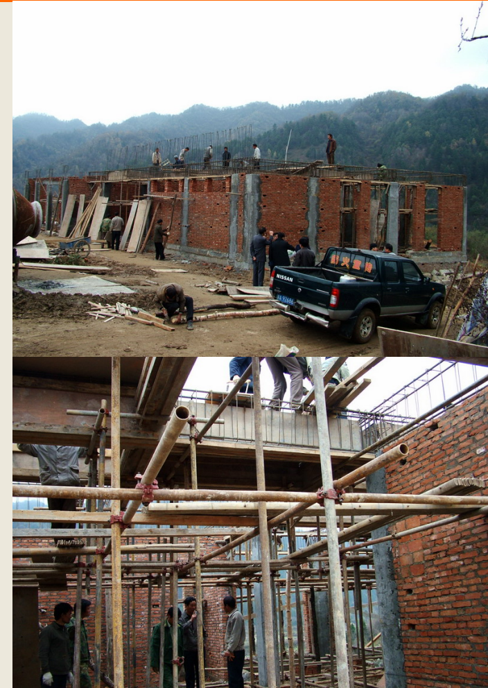
↑ Construction sites of Laoxiancheng Environmental Education Center

The purpose of the center is to educate tourists before they enter the nature reserve. Also it will create a platform to train and build the capacity of the nature reserve and local community. In addition, the lodge and education centre will provide more job opportunities for local communities and generate more income for Laoxiancheng Nature Reserve's monitoring and patrolling work.