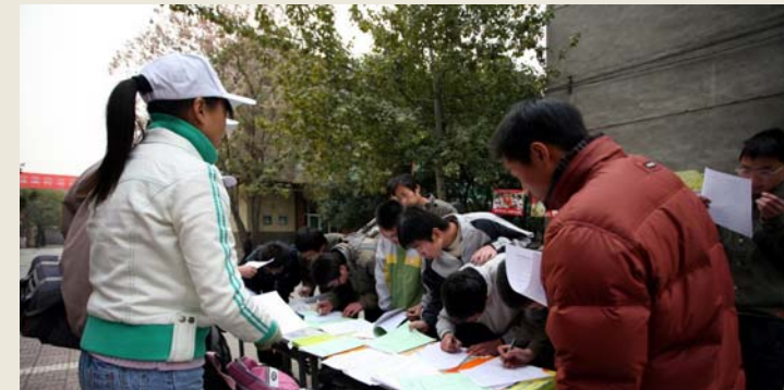
↑ Students are giving suggestions/comments on the organization of this activity.