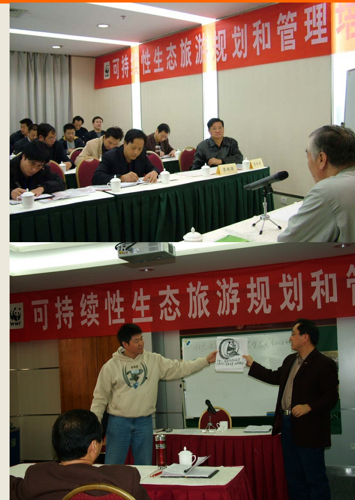
↑ The training combines the lecturing and participatory approach, which has scored very good effects.

After the three-day training, participants evaluated it by positive feedback and suggestions for future improvement. Two experts also paid a visit to Heihe Forest Park and Laoxiancheng Nature Reserve, and gave constructive advice to tourism development.