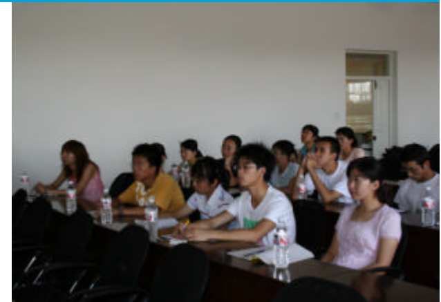
Students in Training Class

On July 15 - 16, WWF Harbin Programme Office in cooperation with the Life Science College of the Northeast Forestry University (NEFU) initiated and organized a series of environmental activities for students. The activities included: training of environmental protection volunteers, field trips to protected areas and areas damaged by fire, training on “public awareness of nature conservation” and “forest biological system protection”, and designing information boards for nature reserves as well. In the meantime, information and data is being collected on conflagration in the Heilongjiang River Basin to make clear understanding about the influence of forest fires on the bio-system of Daxing’anling and Heilongjiang River Basin.