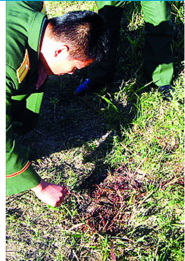
The policemen inspecting the accident site

Amur tiger is one of the most endangered species under national protection. Recently, there are less than 20 wild Amur tigers left in China and only about five hundred left in the world. WWF China Harbin Programme Office has provided financial support to Dongning and Hunchun nature reserves to improve the patrol and communication capacity.