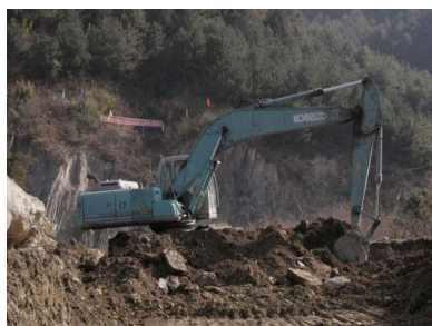
Construction of the Tudiling Tunnel begins

Construction on the Tudiling Tunnel, an important project that will move traffic off a major road that slices through a stretch of panda habitat, officially got underway on 2 March 2009.