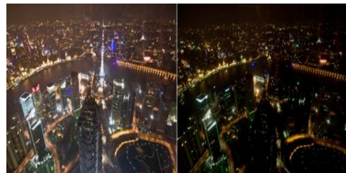
Shanghai goes dark! From the Shanghai World Financial Center the Jinmao Building, Oriental Pearl Tower and much of Pudong District switch off.

At a special Earth Hour event on the top floor of the Pangu Plaza's hotel, partners and the media looked across the Olympic Green as some of China's biggest icons went black. WWF China country representative Dermot O'Gorman said the statement for action on global warming was being made "loud and clear" in China.