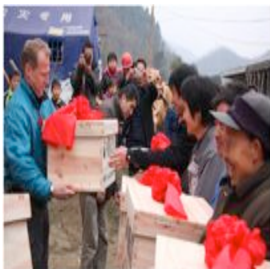
WWF representatives presented 200 beehives to Yuquanba village residents. Beekeeping and tea plantations are some of WWF’s main strategies to support and restore sustainable livelihoods of the communities in and near the Qinmochuan Nature Reserve.