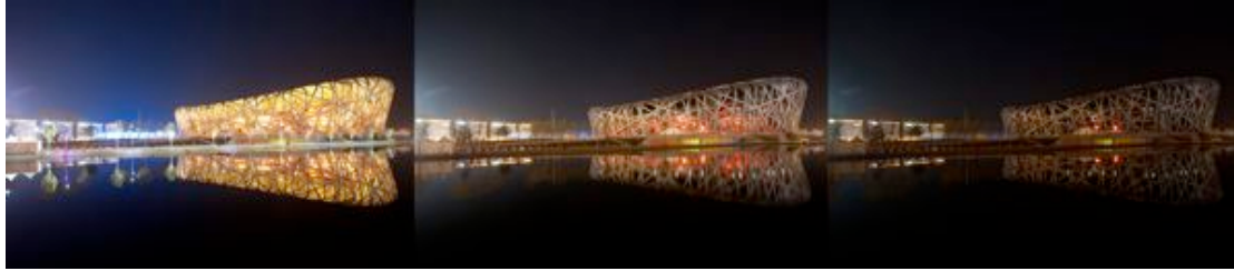
Beijing's National Stadium, the Bird's Nest, turns off its lights for Earth Hour