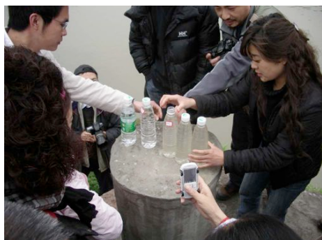
Participants collect water from the Botiao River

WWF and CURA (Chengdu Urban River Association) jointly held a River Scorecard Action, named “Love Chengdu, Love Water”, on March 7, 2009. More than 20 citizens participated. They started from Chengdu's freshwater resource – Botiao river to Fu River, one of the two urban rivers of Chengdu and ended at Huanglong brook.